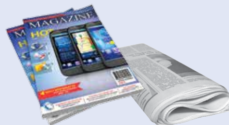
Magazines and newspapers