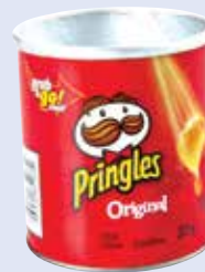
Cardboard cans (Lids are garbage)