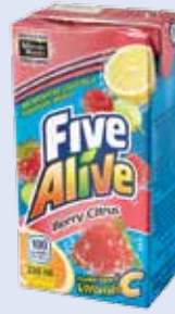
Juice boxes (Straws are garbage)